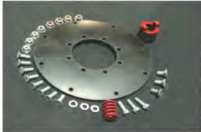
Flex Head Rebuild Kit: APMF1851K